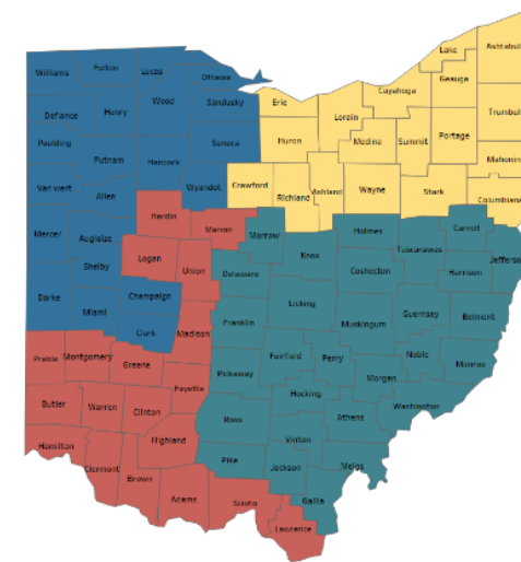
Community Life Engagement (CLE) Project Manager Regions